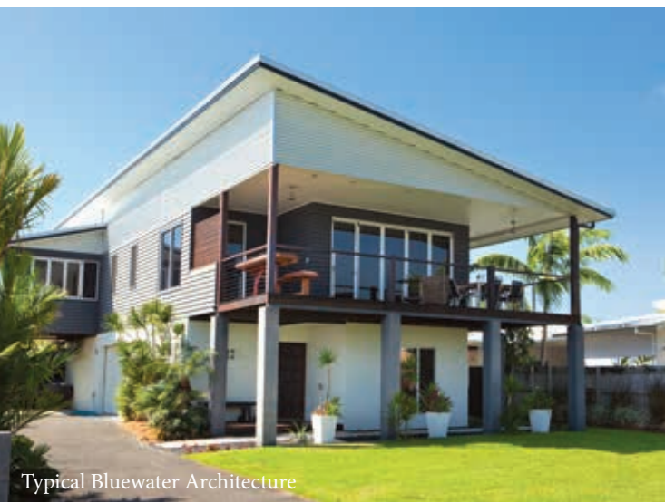
Typical Bluewater Architecture