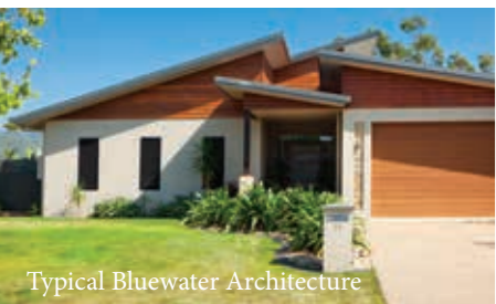
Typical Bluewater Architecture